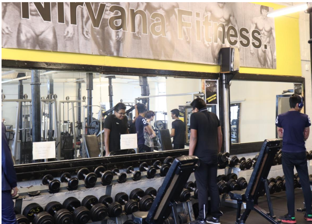
Nirvana Gym: hired out as part of the Beyond the Blade project exclusively for young people

Thornton Lodge Action Group wanted to use Gym activities as a “vehicle for change” in reducing knife related crime amongst young people. It created an environment which attracted young people; a local gym equipped with heavy weights, bench presses, cardio machines and punch bags.