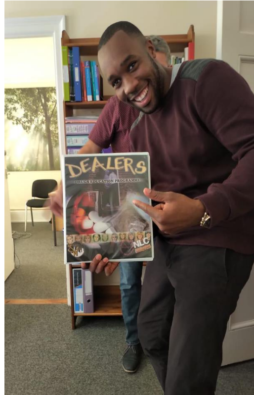
One of the modules from the Streetwise programme

Participants who joined were given a membership form along with an Outcome Star form, see appendix. The Outcome Star was our tool to measure the impact of our intervention and for us to review the change in behaviour. The Outcome Star asked a series of questions at the start of the programme, these were then revisited at the end of the programme to see the distance travelled by the participant.